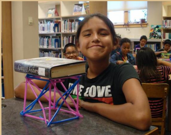
Students were able to enjoy a wide variety of activities thanks in part to BCF's $1,000 gift to Big Horn County Library.

Send flowers anywhere. Make an impact right here in Billings.