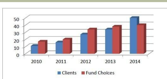
Billings Community Foundation Clients and Funds